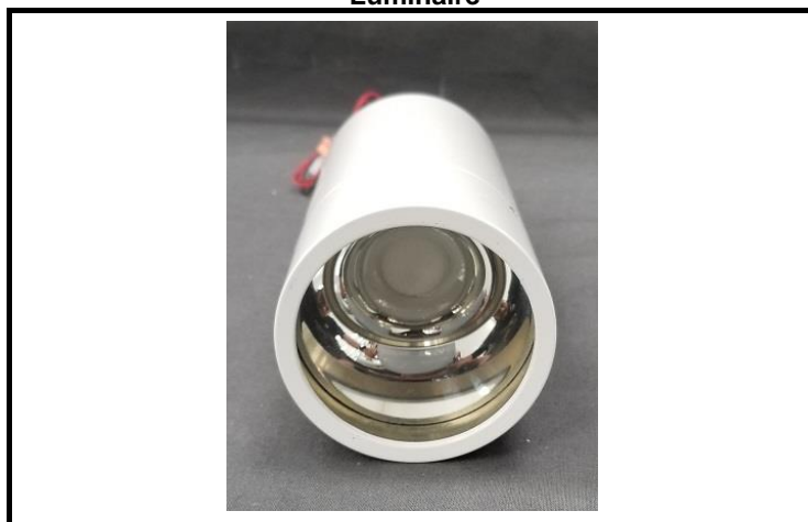
Luminaire Characteristics Luminous Diameter: 2.75 in.

Total Luminaire Output: 675.4 Lumens Luminaire Efficacy: 32.5 lm/w Maximum Candela: 977 Candela