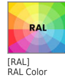
[RAL] RAL Color