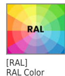
[RAL] RAL Color